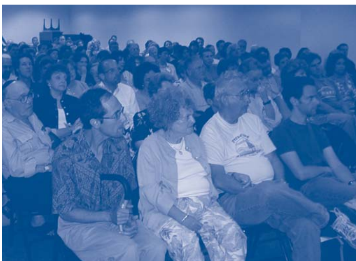
A standing-room only crowd gathers at San Diego's Jewish Community Center ready to mobilize against the Jews for Jesus crusade.